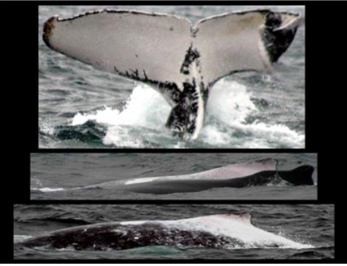
Figure 2- LEFT The body anomalies note possible tumor in the peduncle with irregular whitish lesion. RIGHT Deformities in the tail, hypo pigmentation.